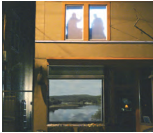
Big Eddy Dinner

positioned on the Pennsylvania side. At the same time, a video juxtaposes scenes of interior office architecture with footage shot in and around the river. The Morse code spells out trade agreements and washes away the video images on the screen. Mat Rappaport's art work has been exhibited in the United States and internationally in galleries, film festivals and public spaces. His current work utilizes mobile video and performance to explore habitation, perception and power as related to built environments. Rappaport is a co-initiator of V1B3 [ www.v1b3.com ], which seeks to shape the experience of urban environments through media based interventions.