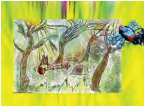
Storyboard Flame Schon