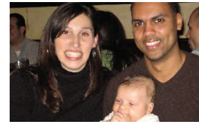
D.I.D. Doing it Digitally

Join us for these DIGIT screenings and special events: