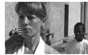
68' & Clear Dawn Westlake